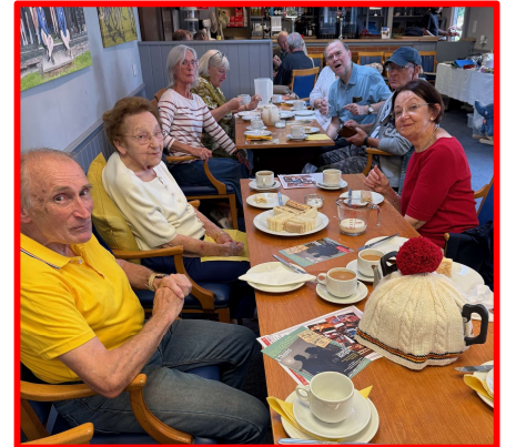
Some of those who attended the 2025 Afternoon Tea